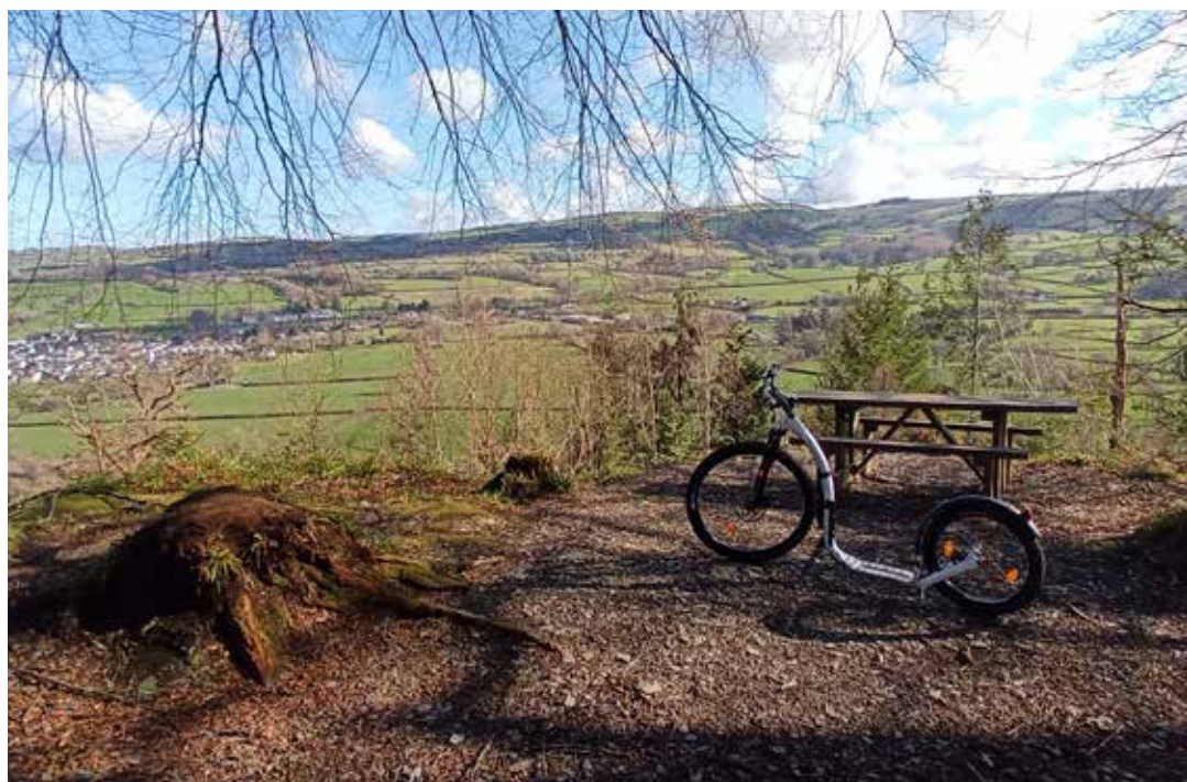
Bowling Green Picnic Area

This is a long fast route, which later joins a bend of another track. When you see this bend, slow right down, as on the right is a viewing point that King Henry VII played bowls - yeah unbelievable !