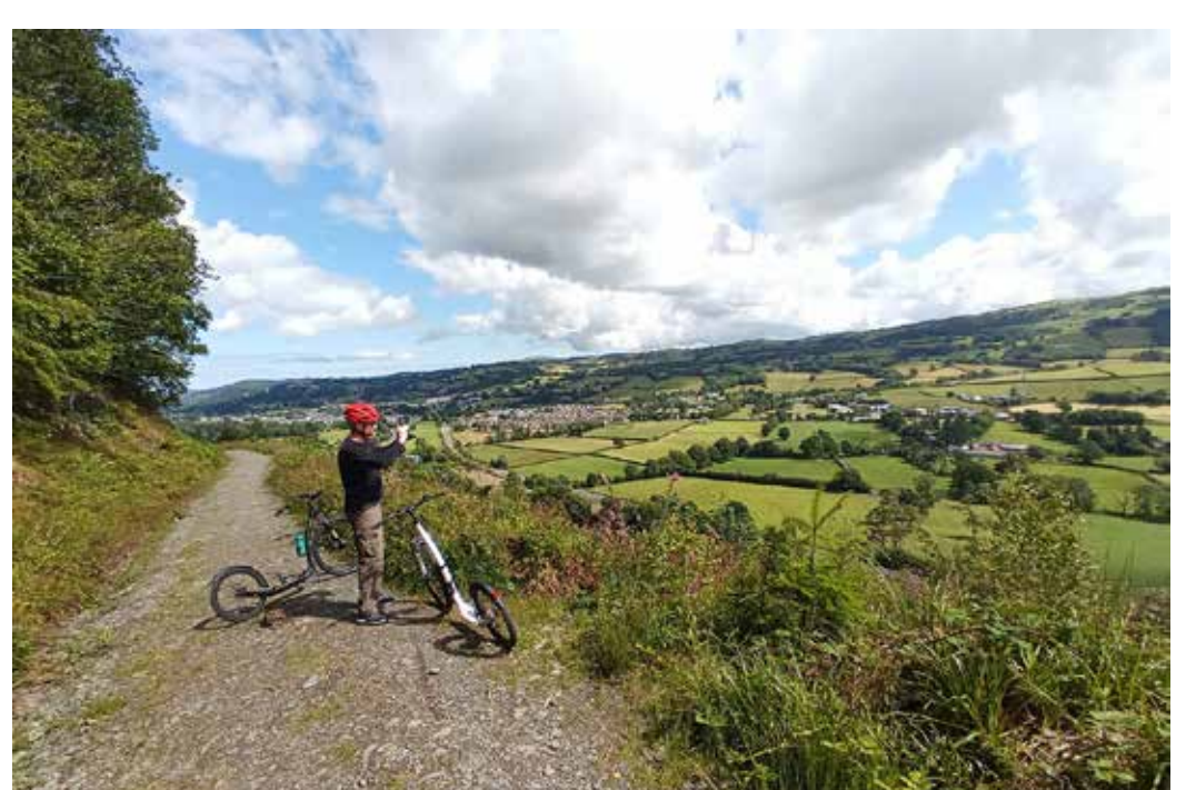
View from Hollywood route