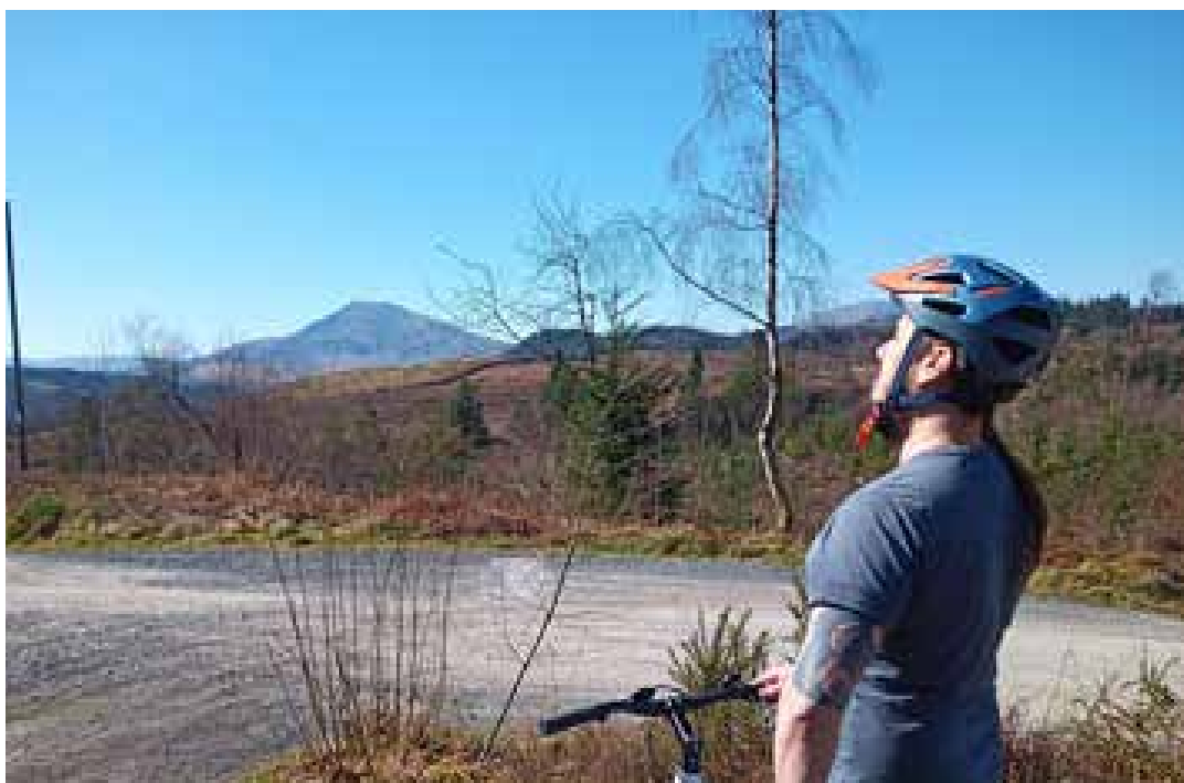
Views of Moel Siabod

Walking up this hill allows you to take photos of the stunning Moel Siabod Mountain, at 872 metres (2,861 ft).