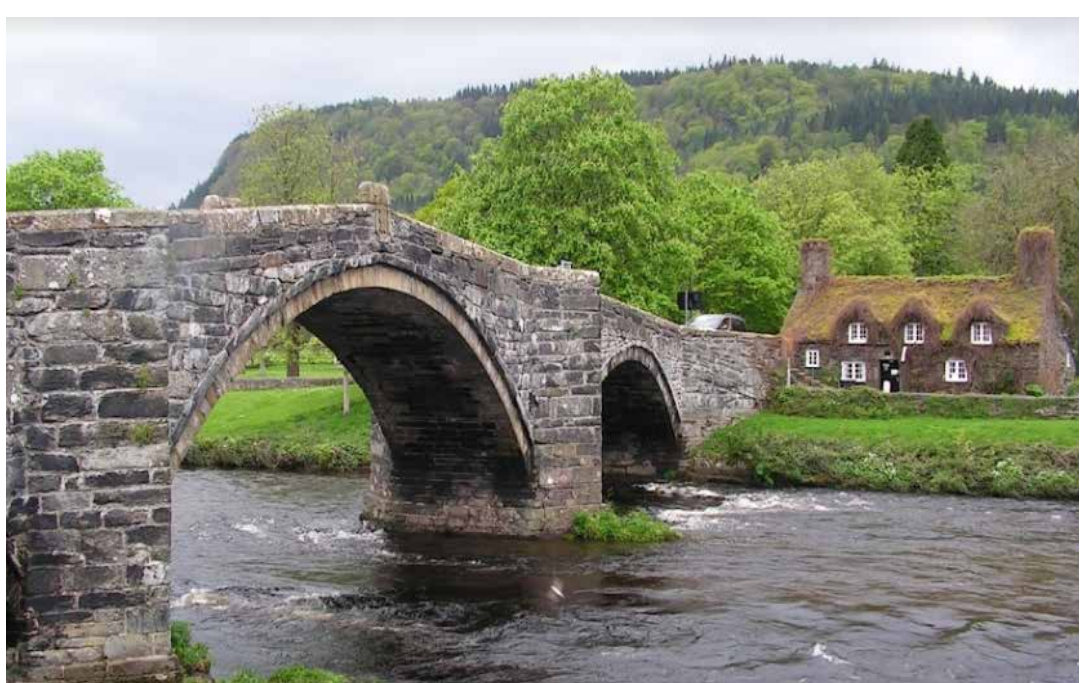
Tu Hwnt yr Bont & Llanrwst Bridge

The path curves right to head down the Nant road and takes you all the way back to the stone bridge.