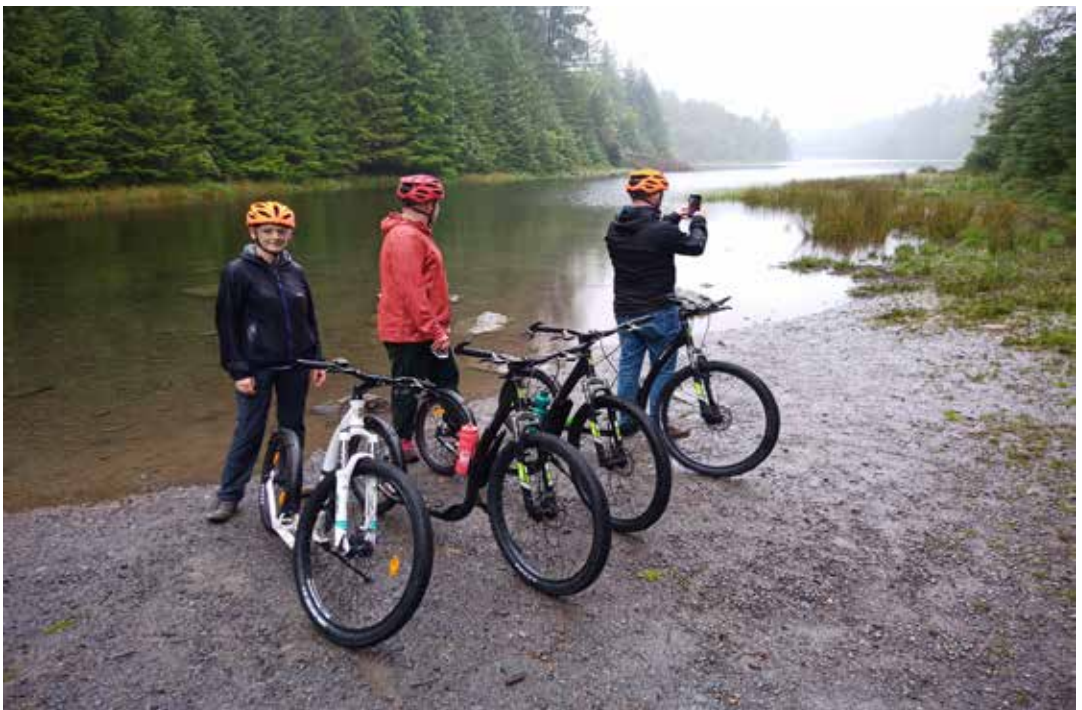
Llyn Parc Shore Line

The track after this incline is a single track, and as this is a public footpath you MUST GIVE-WAY to the walkers. Stop and chat, so we all can enjoy this mountain. As you come out of the wooded area the path opens and the views of the Conwy Valley are stunning so please stop to take in the views.