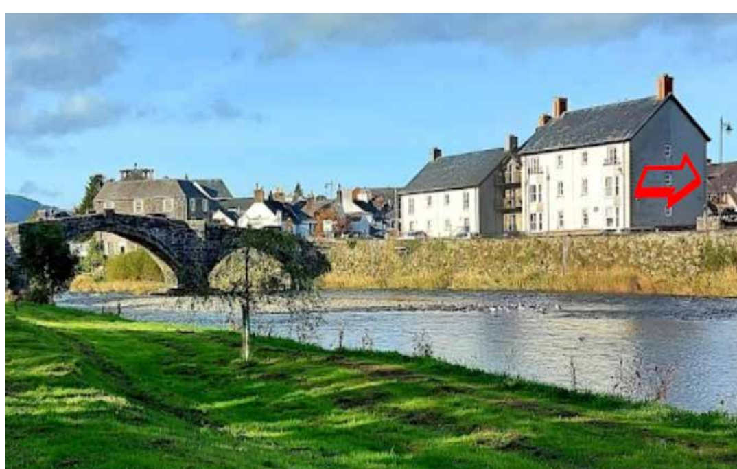
Entrance to Watling Street

Dismount and walk across over the stone bridge and turn right onto the pavement and wait for a gap in the traffic to cross the main road. You will see a junction at the end of Watling street which leads you back to the Bike hut.