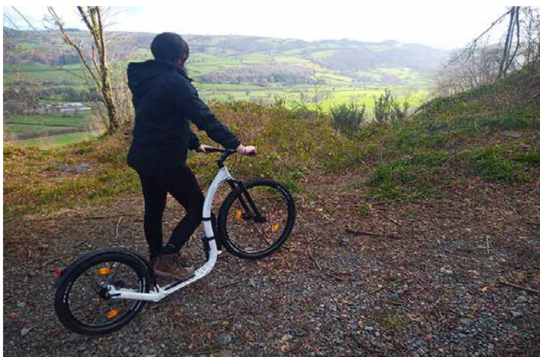
Bowling Green Views

This track now is a flat down hill, again do NOT get to excessive speeds , for firstly your safety, but also that of other walkers using the track. At the bottom the track leans left where you will come across a round about, go around and come back on yourself to see a small track on the left that you passed - this is the start of you route home.