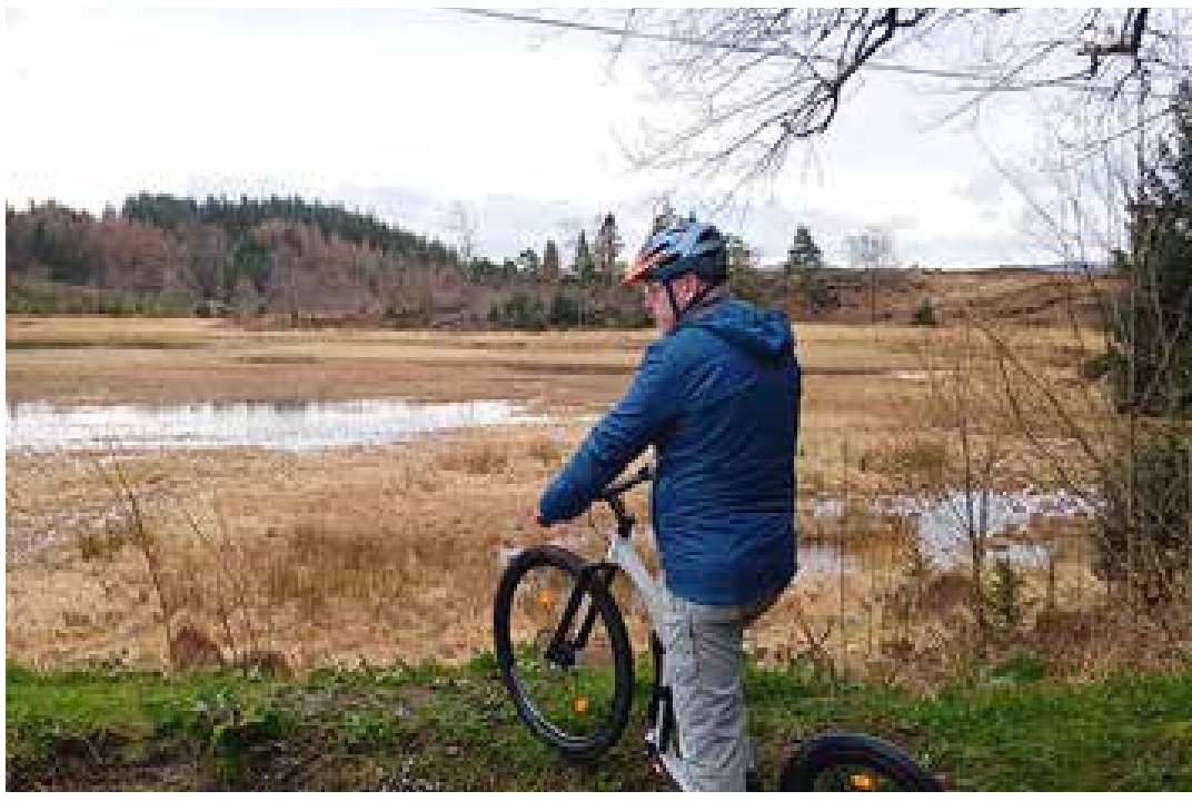
Car Park view of Lake Sarnau