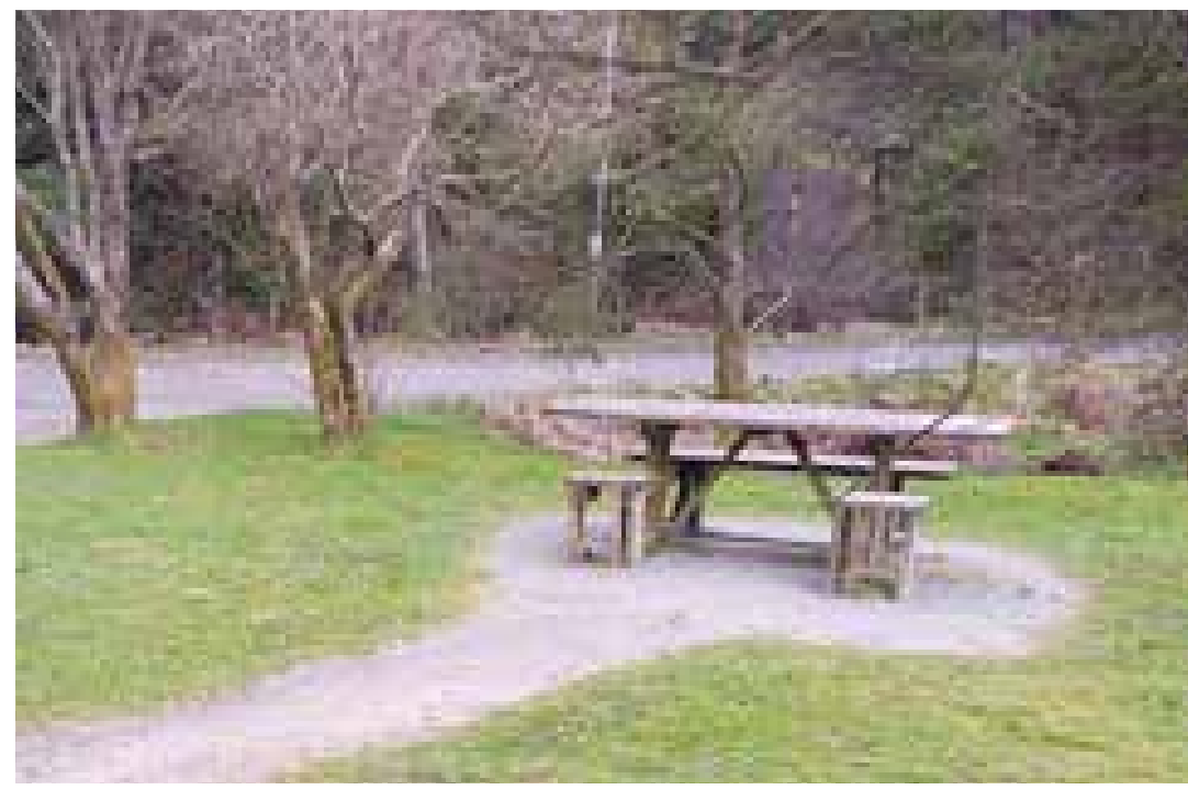
Route to take behind picnic area

From the car park head down the track with lake (marsh) sarnau on your right. The start is fairly flat with a few parts that need effort or a walk. On the first big downhill make sure you stay left to head back up the hill.