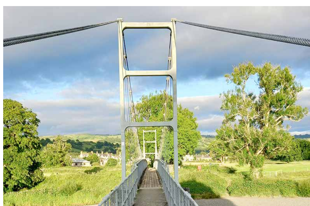
Dismount going over Gowers Bridge

Crossing the bridge you will see the ground work alterations to the valley to help it cope when the winter floods .