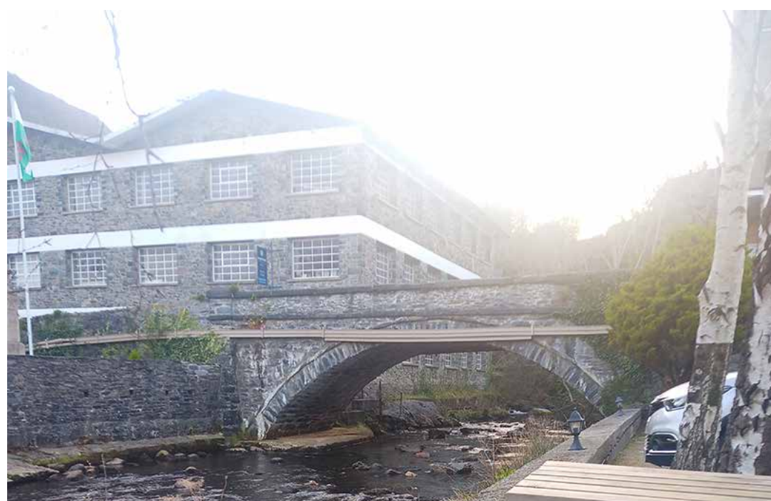
View of Trefriw Bridge from the Fairy Falls Hotel

At the end of the road on the left is a tourist information board with lots of information about Trefriw.