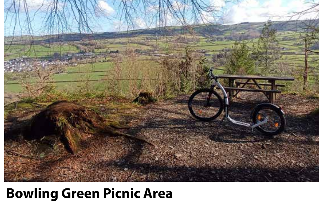
At the top you are rewarded some great views

For the Nant Extended route we suggest you turn left here first, and head up the hill. The hill is a mix of flats that you can scooter, or if you are fit as the inclines are not very sever.