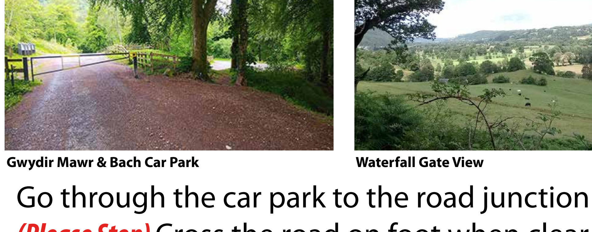
Waterfall Gate View

start their journey on this formally know MTB route called the "Marin Trail".